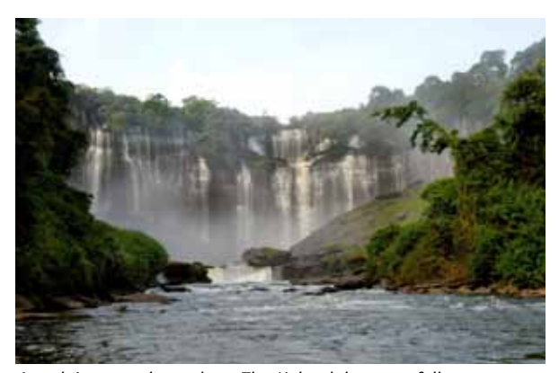
Angola's natural wonders: The Kalandula water-falls.